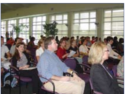
UH faculty and students at the symposium

On April 03, 2006 HHP, in conjunction with the TIGER study, hosted a mini symposium that focused on research related to our nation's obesity epidemic. The symposium was held in the Elizabeth Rockwell Pavilion in the newly remodeled M.D. Anderson Library on the main campus. In addition to presentations by several of the HHP faculty, this event featured two speakers of international prominence,